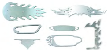
Stainless Steel Accessories