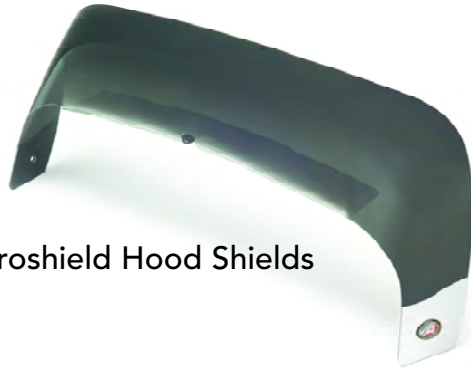
Aeroshield Hood Shields